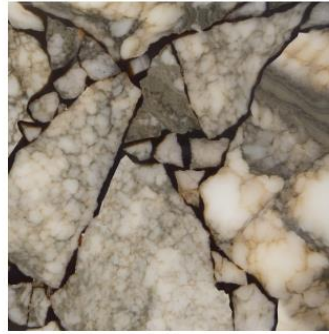
Parisian Quartzite – COMING SOON Amberlite Elite