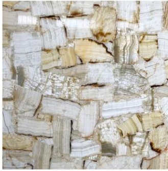
Artesian Amberlite Elite