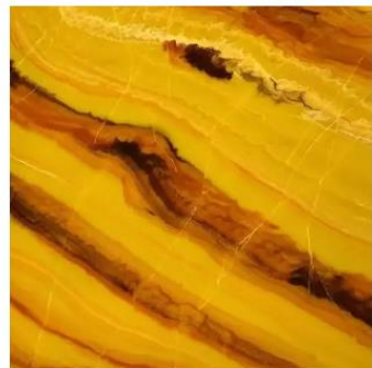
Honey Orange USA STOCK

Amberlite is a man-made alternative to onyx and will display variation in colour and movement patterns. Standard samples are indicative only and may differ slightly from products supplied.