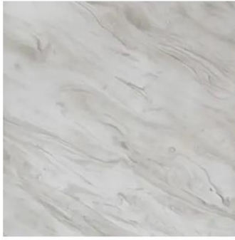
Chiffon White USA STOCK