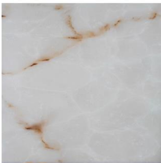
Onyx White USA STOCK

Please note that Amberlite is not a DIY product.