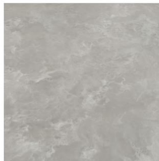
Alabaster White USA STOCK