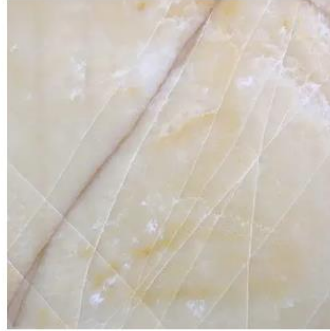
Tuscan Yellow Dark USA STOCK