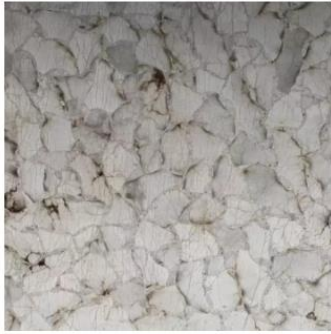
Cracked Ice Amberlite Elite

Amberlite Elite comprises a gossamer thin interlayer of real natural stone arranged by hand and encapsulated between two clear resin panels.