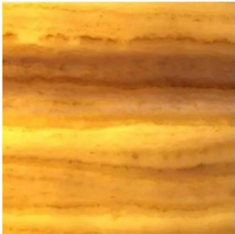
Sahara USA STOCK