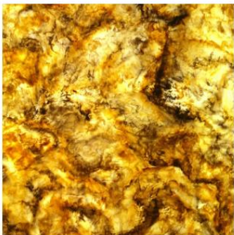
Tobacco USA STOCK