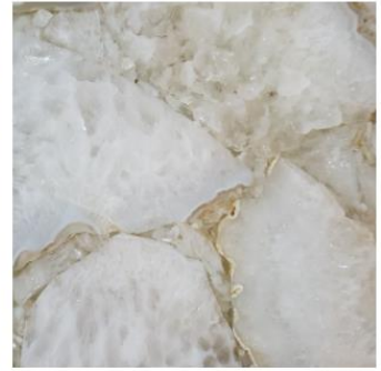
Snow Quartz – COMING SOON Amberlite Elite

Amberlite is not just a flat panel material it can be curved & shaped and can be textured too. We can even custom produce subject to minimum order requirements.