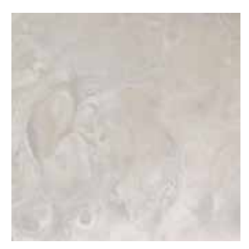
Alabaster White USA STOCK