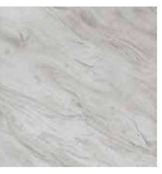
Chiffon White USA STOCK