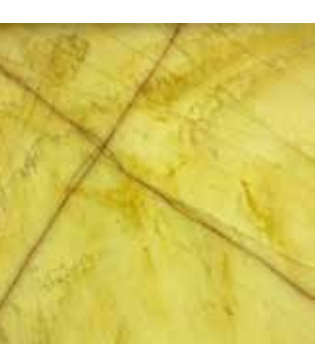
Tuscan yellow light