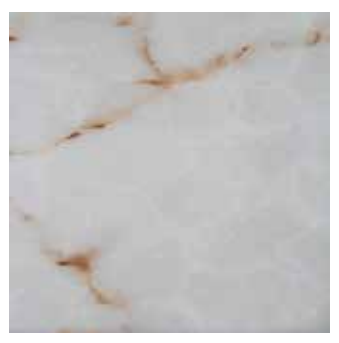
Onyx White USA STOCK