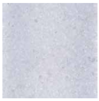
Crystalite White NEW 2025