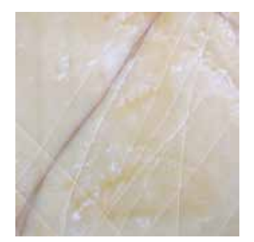
Tuscan yellow dark USA STOCK