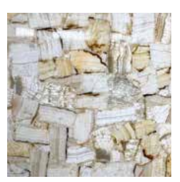
Artesian USA STOCK