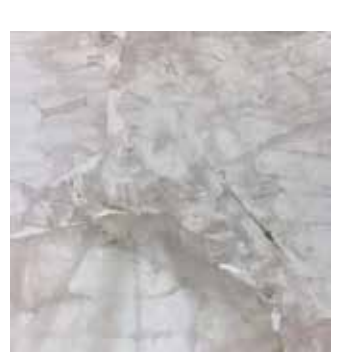
Cracked Ice USA STOCK