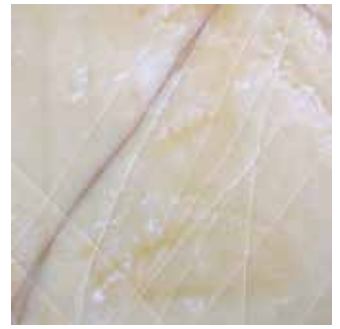
Tuscan yellow dark type A