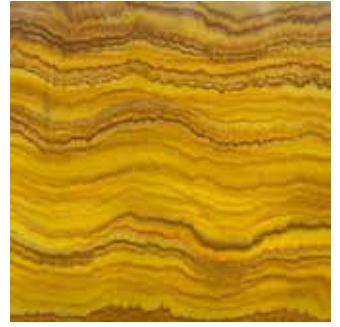
Bengali Tiger type A