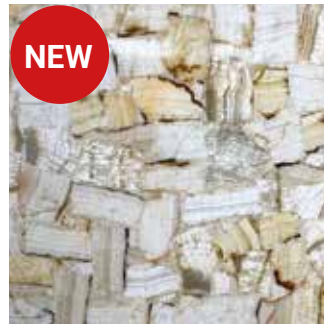
Artesian type A