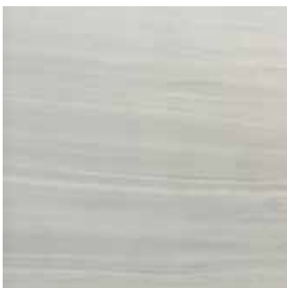
Linen White type A