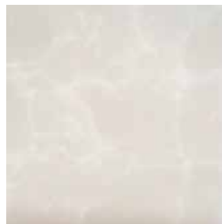
Arctic White type A UK STOCK