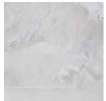
Persian White type A UK STOCK