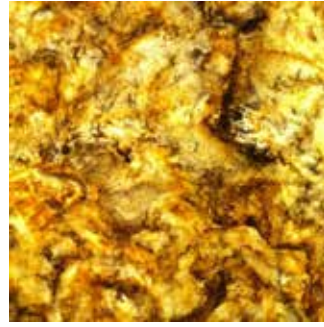
Tobacco type A UK STOCK