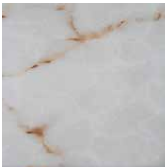
Onyx White type A UK STOCK

Our standard sample size is 100 x 100 and samples can be ordered by emailing sales@amber-lite.com