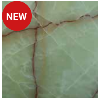
Jaipur Green type A

If you don't see anything you like we can produce custom designs, get in touch with us to discuss your personal design requirements.