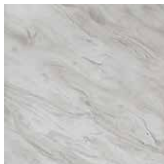
Chiffon White type A