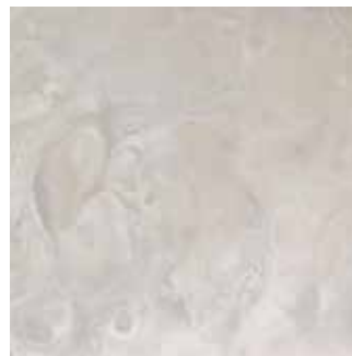
Alabaster White type A UK STOCK