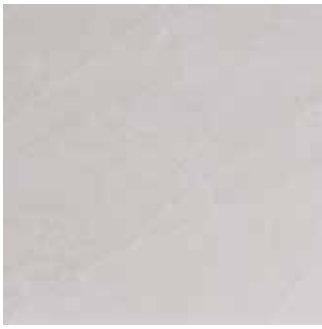
Bleached Cotton type A