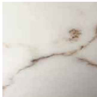
Marble White type A