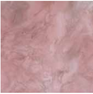
Blush pink type A UK STOCK