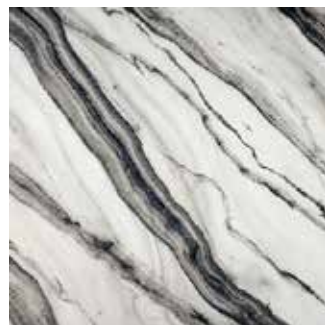
Pavonazzo type A