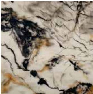
Veneziano type A