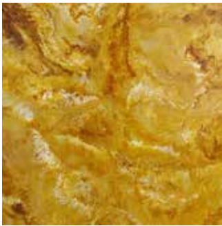
Giallo Sierra type A UK STOCK