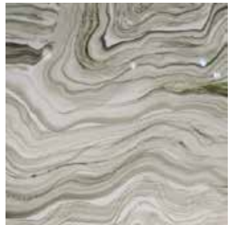
Verdant type A