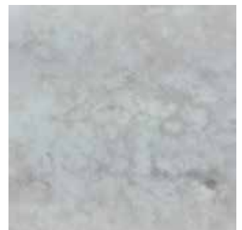
Ethereal White type A

Amberlite is a man-made alternative to onyx and will display variation in colour and movement patterns. Standard samples are indicative only and may differ slightly from products supplied.