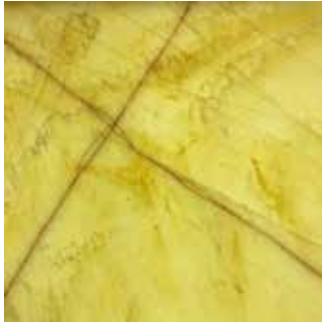
Tuscan yellow light type A