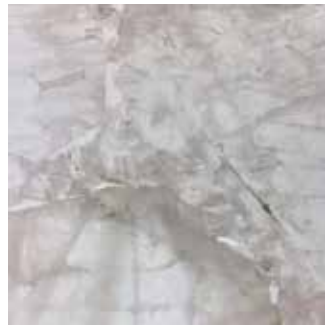
Cracked Ice type A UK STOCK