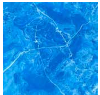
Sapphire Blu type A

Amberlite is a man-made alternative to onyx and will display variation in colour and movement patterns. Standard samples are indicative only and may differ slightly from products supplied.