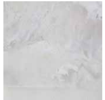
Persian White type A UK STOCK